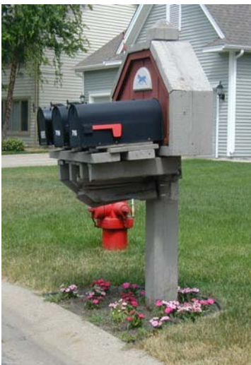
Example of Community Mailboxes Where Paper Boxes Were Struck by Winter Maintenance Equipment (too low and forward of back of curb)