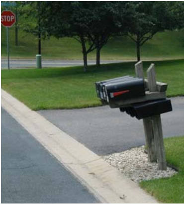
Another Community Mailbox at Risk of Being Struck by Winter Maintenance Equipment