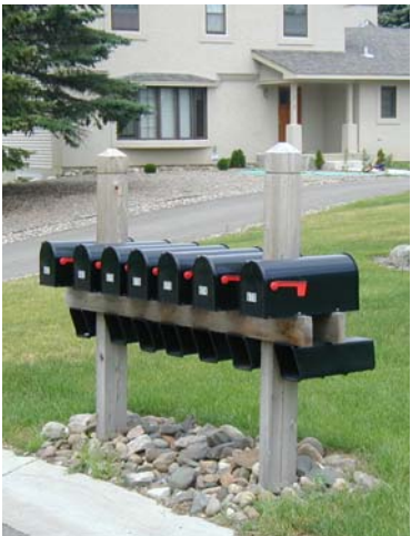
New Manley Mailbox Construction/Design Providing 48" Clear Zone For Winter Maintenance Operations