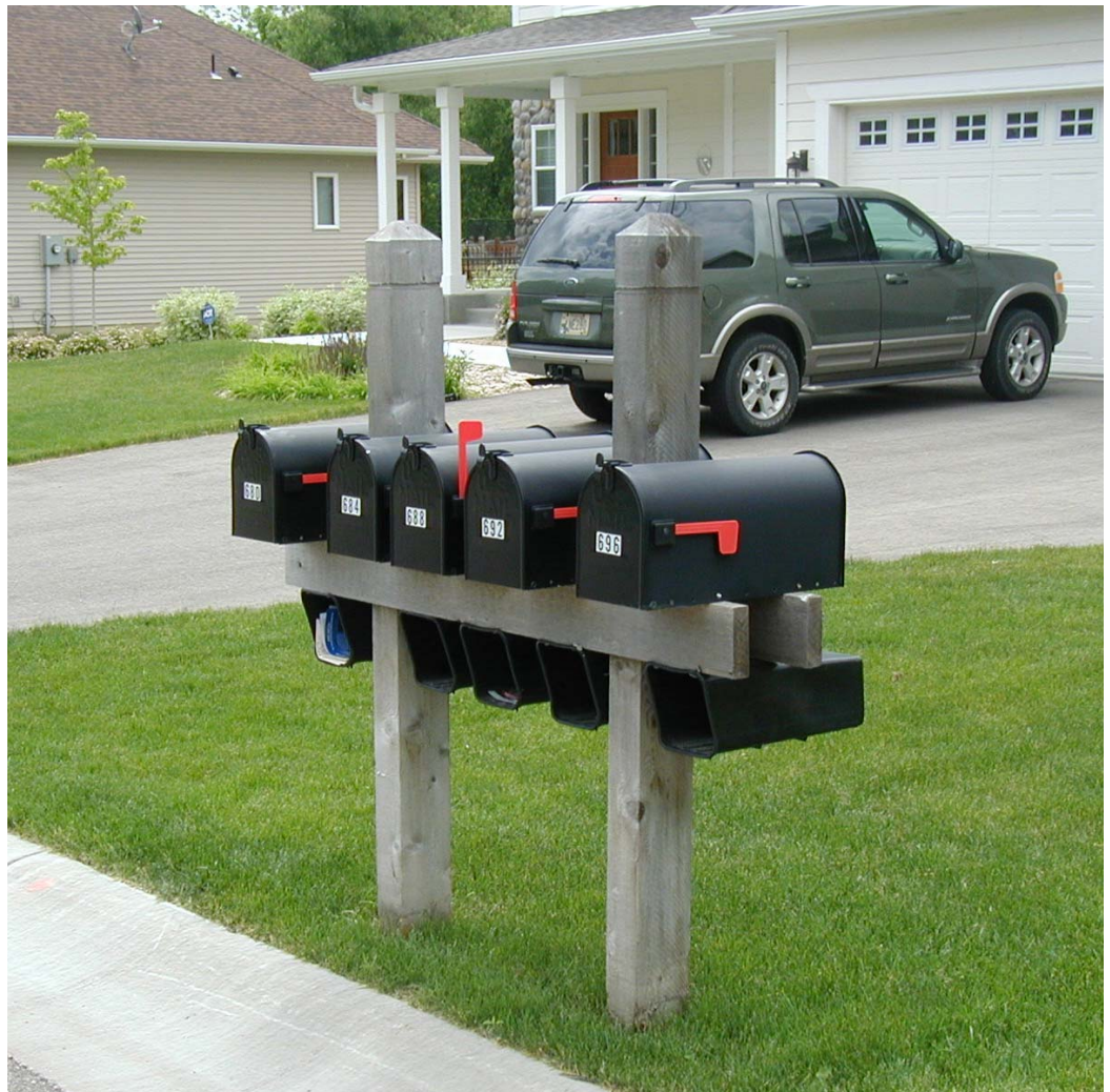
Mailboxes Installed in Manley Addition (Dodd Rd. south of Cliff Rd)