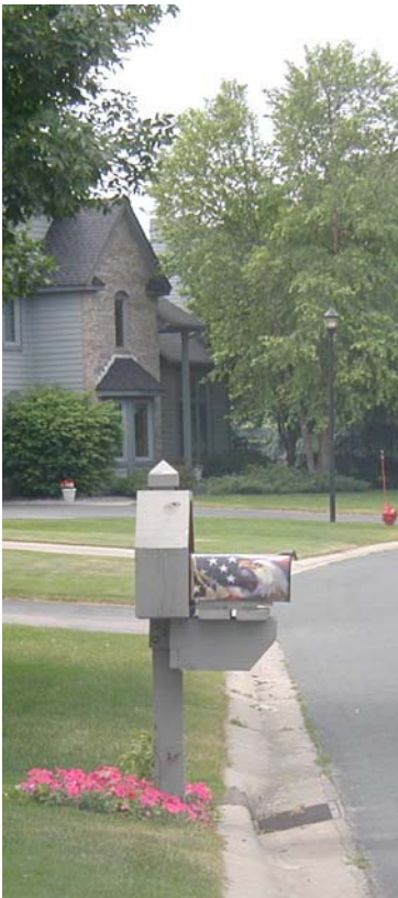
A Typical Community Mailbox at Risk of Being Struck by Winter Maintenance Equipment (too low and forward of back of curb)