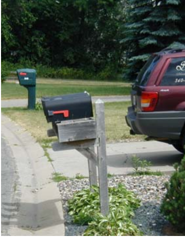
Another Community Mailbox at Risk of Being Struck by Winter Maintenance Equipment (too low and forward of back of curb)

An ideal mailbox design has been adopted/installed by the Manley Developers in new developments adjacent to Dodd Rd. south of Cliff Road. We have incorporated this design into a new, easy to understand, standard City Mailbox Plate. (please see attached draft new standard City Plate for mailboxes)