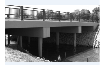
The new design is especially apt for short-span bridges common in rural areas where bridge closures result in long detours.