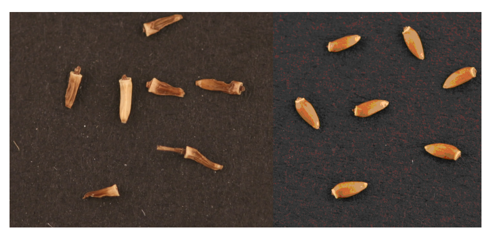
Many seeds produced by Canada thistle stands are empty (left), without the embryo and starch accumulation of a regular seed, and so cannot germinate. Full seeds (right) are shown for comparison.

Minnesota Department of Transportation Research Services Section MS 330, First Floor 395 John Ireland Blvd. St. Paul, MN 55155-1899 (651) 366-3780 www.research.dot.state.mn.us