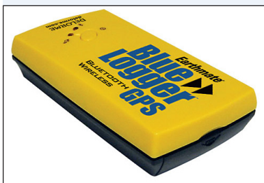
Small (1.5-inch) WAAS-enabled GPS units mounted on bicycles tracked commuter routes and speeds.