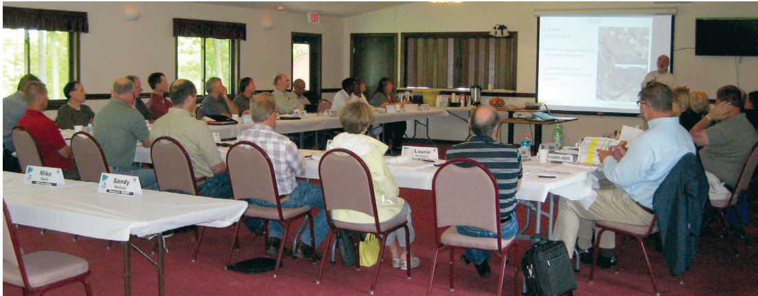
The LRRB board, pictured here at our summer 2015 meeting, meets four times per year.

The winter meetings are reserved for identifying the projects that the LRRB will fund in the upcoming calendar year. LRRB members hear brief presentations from the research investigators and have the opportunity to ask the researchers questions.