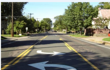
This section of Fairview Avenue in St. Paul is shown after its conversion to a three-lane roadway with a TWLTL.